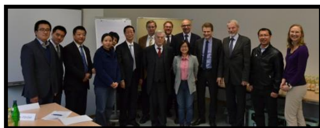
Workshop on new developments of Administrative Procedure Law “聚焦《行政程序法》新动向”研讨会

2014年11月4日，由中国政法大学中欧法学院研究项目资助的“聚焦《行政程序法》新动向”研讨会在德国汉堡举行。此次研讨会特别关注了中德两国《行政程序法》的新发