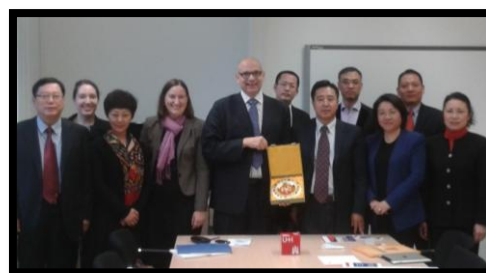
Visit from BJLA 北京律协代表团访问我院汉堡办公室

2014年12月10日，北京律协代表团访问了中欧法学院位于汉堡的合伙人办公室，双方就未来合作并派遣中国律师赴欧参加培训等事项进行了磋商。