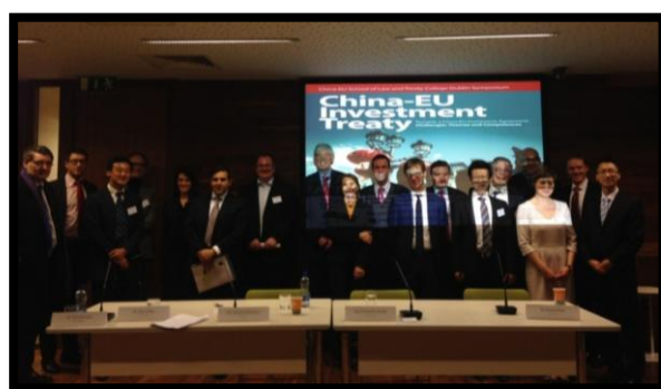
Conference on “Towards a China-EU Investment Agreement: Challenges, Themes and Competences” “中欧投资协定：问题、主题与权限”研讨会