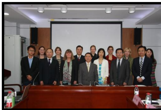
“China-EU Environmental Law” Workshop 中欧环境法研讨会

2014年10月20日至21日，由中国政法大学中欧法学院组织的“中欧环境法研讨会”在中国政法大学举行。此次研讨会吸引了来自中国政法大学中欧法学院合作院校的隆德大学、鲁汶大学、博洛尼亚大学、中国政法大学、清华大学以及来自厦门大学和重庆大学等中、欧知名院校的众多专家学者参与。会议期间，学者们就当今中、欧环境法领域的不同话题和所面临的挑战各抒己见、深入交流。议题包括：环境法立法趋势与中国环境保护法修正案、不断变化的目标、新技术与立法者、排放交易机制、气候变化立法、化学品风险管控的相关法律与打击环境犯罪、环境法的行政强制执行、公益诉讼与环境问题的大众参与。此次研讨会所总结的观点将收录在《中欧法律杂志》中。